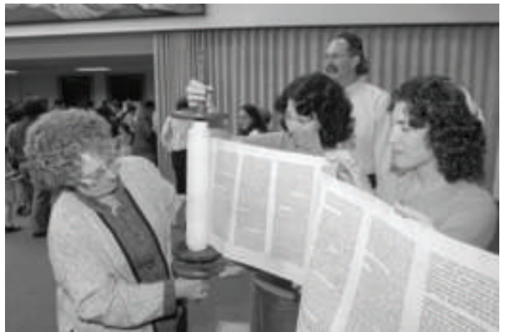
Simchat Torah

Medals were won, friendships were made and a fantastic time had by all. Maccabi 2008 will be in either Detroit or San Diego. For those who will be between 13 & 16 on August 1, 2008, kick off party will be at the JCC on Sunday, November 18 at 6:30 PM.