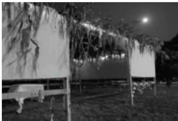
Sukkah by moonlight

The Sinai Temple Bulletin is published monthly by Sinai Temple, Springfield, Massachusetts. This is Issue Number 3 for the year 2007-2008.