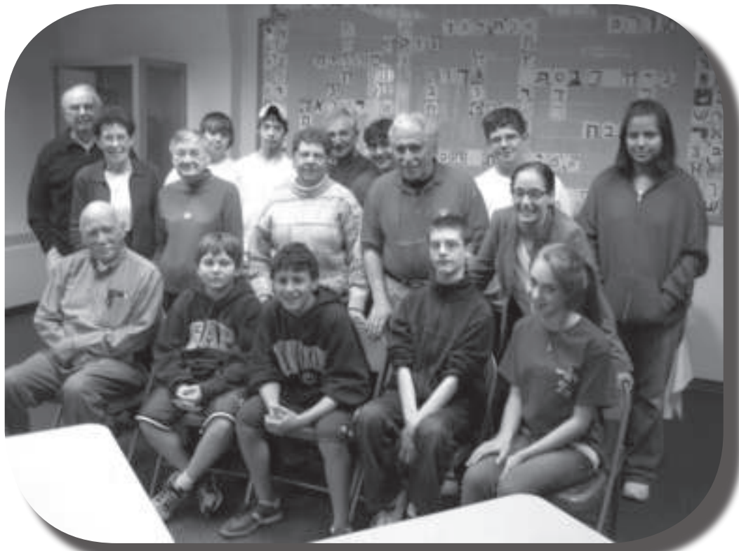
8th Graders learning with Sinai Seniors on Tuesday evening's this semester

NON-PROFIT ORG. U.S. POSTAGE PAID SPRINGFIELD, MA PERMIT NO.537