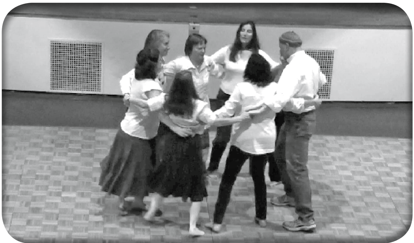
An Israeli dance by Sinai congregation members was presented as part of Sinai Temple's celebration on April 12 of the 65th Anniversary of the creation of the state of Israel.