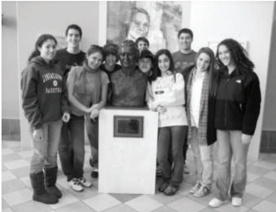
This year's Confirmation Class recently spent a wonderful weekend exploring the history of the Civil Rights movement and Jewish connections. The class is pictured here at the Rosa Parks Museum in Montgomery, Alabama.

NON-PROFIT ORG. U.S. POSTAGE PAID SPRINGFIELD, MA PERMIT NO.537