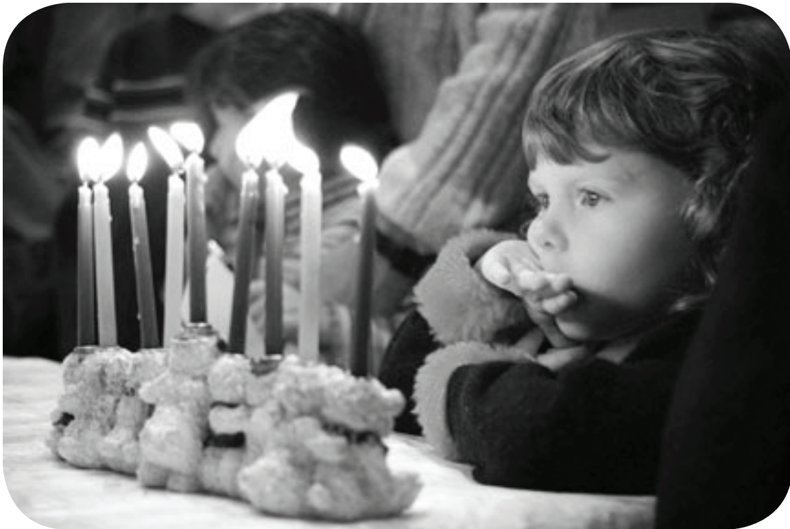
Chanukah 2006