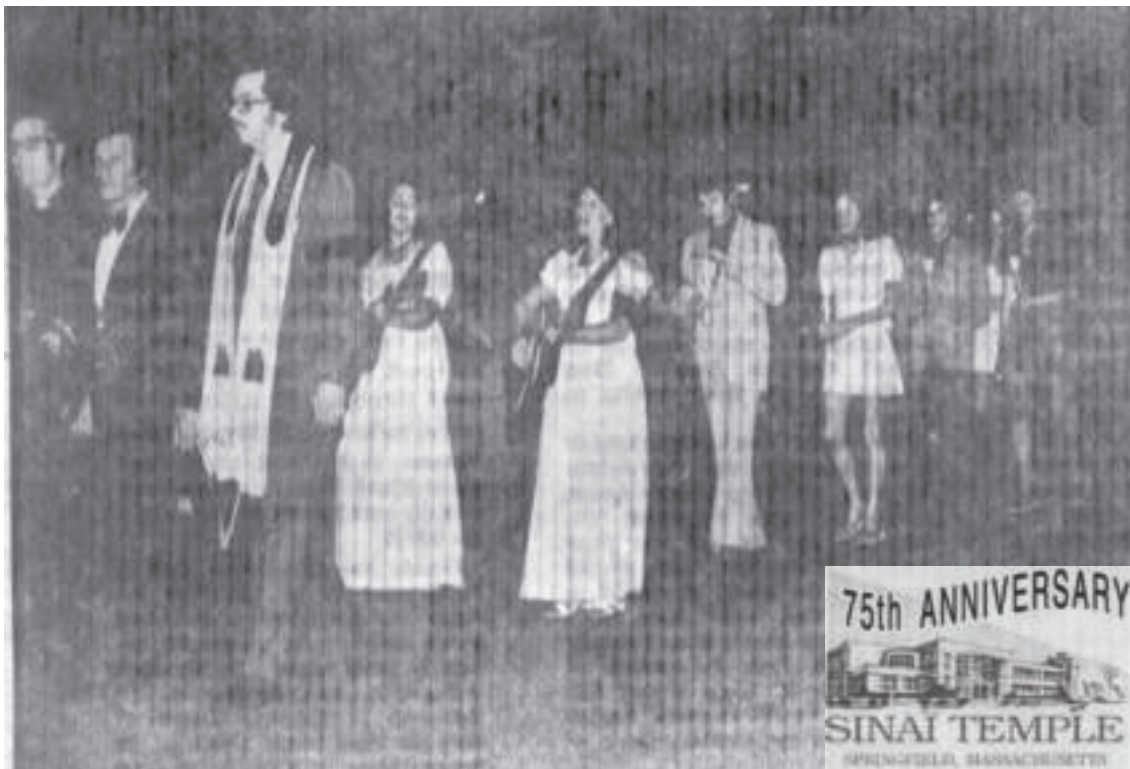
On Friday evening, May 17, 1974, a single line of mourners, all wearing black arm bands, marched in silence from Sinai Temple in memorial to Israeli children slain by Arab terrorists in Israel. Twenty-two children carried candles, each in memory of one of the slain children.

NON-PROFIT ORG. U.S. POSTAGE PAID SPRINGFIELD, MA PERMIT NO.537